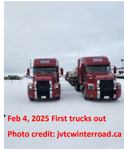
Feb 4, 2025 First trucks out

March 30 saw the closure of the Tibbitt to Contwoyto Winter Road to northbound loads with southbound traffic wrapping up with the closure of the road on April 3 rd . This vital 400 km resupply route operated from February 12 th hosting over 5000 northbound loads of fuel, equipment and other bulk goods to the Diavik, Ekati and Gahcho Kué diamond mines (the latter connected with a 120 km winter road extending from the main Tibbitt to Contwoyto Winter Road) and southbound transport of recyclable and surplus material.