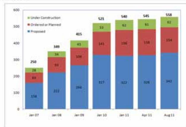
Exhibit 2. Global Nuclear Reactors Under Construction, Planned or Proposed

http://kivalligenergy.com/resources/20110825Uranium_Versant_Industry_Update_Featuring_KIV.pdf