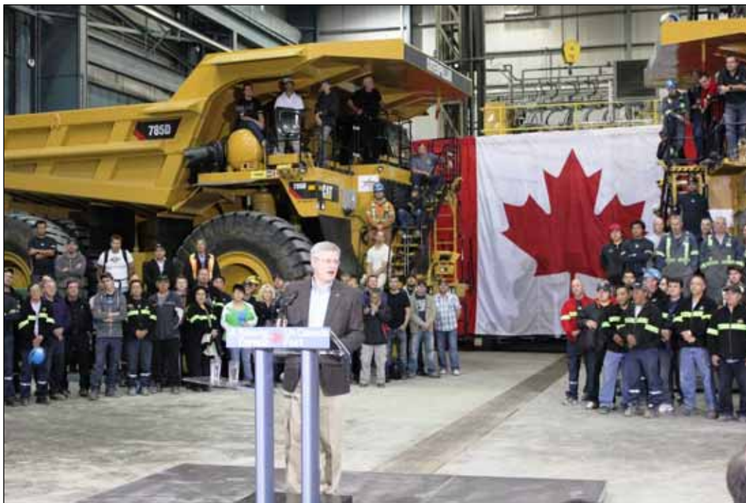
Prime Minister Stephen Harper announced support for the Chamber of Mines during a visit to Nunavut's only operating mine, Agnico-Eagle's Meadowbank gold mine.

It is intended that at the end of the three year pilot project the Chamber of Mines office in Nunavut will become self-sustaining.