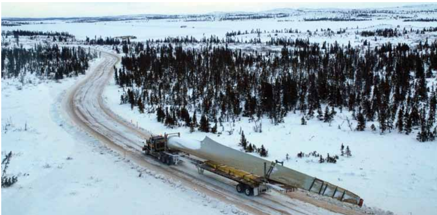
Blades for the wind turbines were the longest loads ever shipped over the ice roads: 33 meters.

development and northern resident scholarship programs. As well, Diavik's work with local communities was rated "exceptional." One of the key characteristics measured was Diavik's training opportunities and skills development initiatives. Highlights in 2011 include: