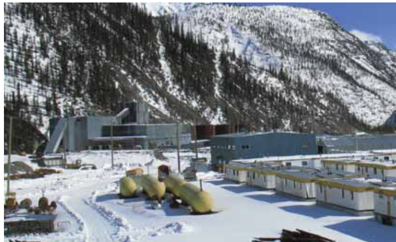
Canadian Zinc Corporation's Prairie Creek Minesite