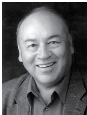
NWT Premier, Bob McLeod

“MTO’s have hit on the right formula... Industry, federal and territorial governments must work together to move things forward.”