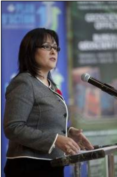
CanNor Minister Leonna Aglukkaq

The Canadian Northern Economic Development Agency (CanNor) will invest $3.275 million over three years (2011 to 2014) to support continuing geoscience research and data analysis in the Northwest Territories. “The Government of Canada recognizes that reliable information ... is essential to attract resource development and support the dynamic economic growth we are seeing across the North,” said Minister Aglukkaq. “The data gathered from these projects will provide more certainty for industry and investors, create job and business opportunities for Northerners, and support land use planning.”