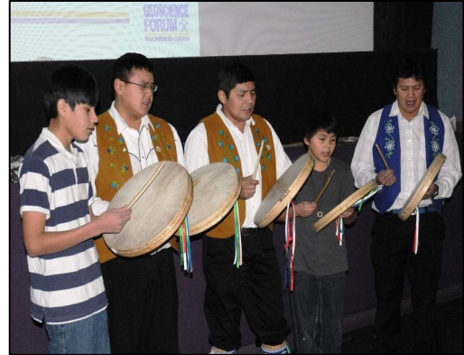
Yellowknives Dene Drummers will open Forum