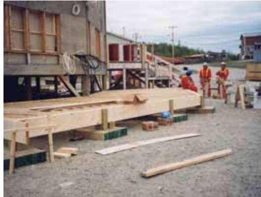
The Wekweeti arbour hosted the 2001 annual Tlicho gathering.

Participants experienced hands-on work under the direction of experienced journeymen who taught carpentry, plumbing, electrical, and mechanical skills.