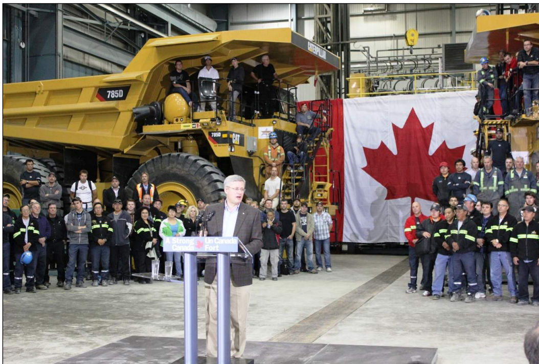
Prime Minister Stephen Harper announced support for the Chamber of Mines during a visit to Nunavut’s only operating mine, Agnico-Eagle’s Meadowbank gold mine.

It is intended that at the end of the three year pilot project the Chamber of Mines office in Nunavut will become self-sustaining.