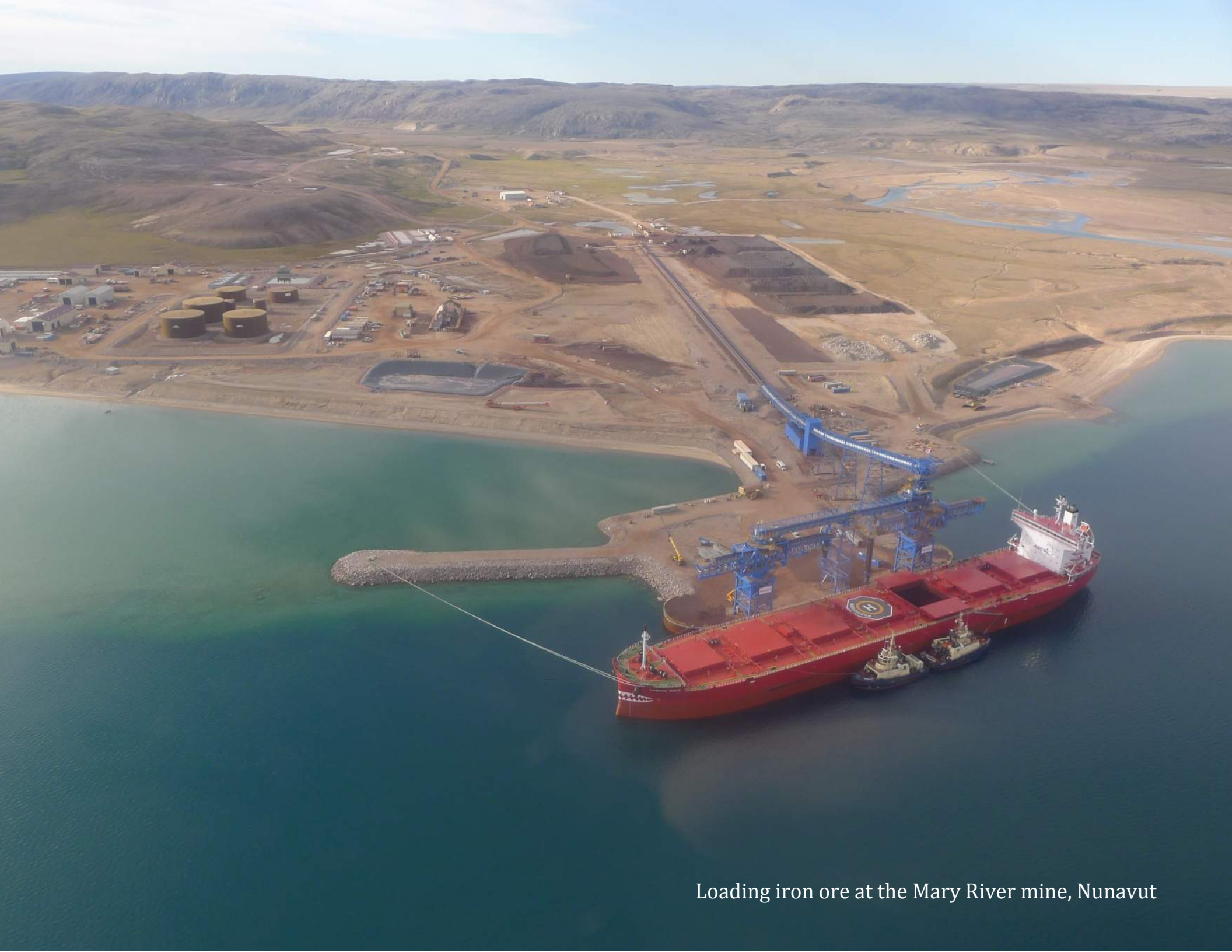
Loading iron ore at the Mary River mine, Nunavut