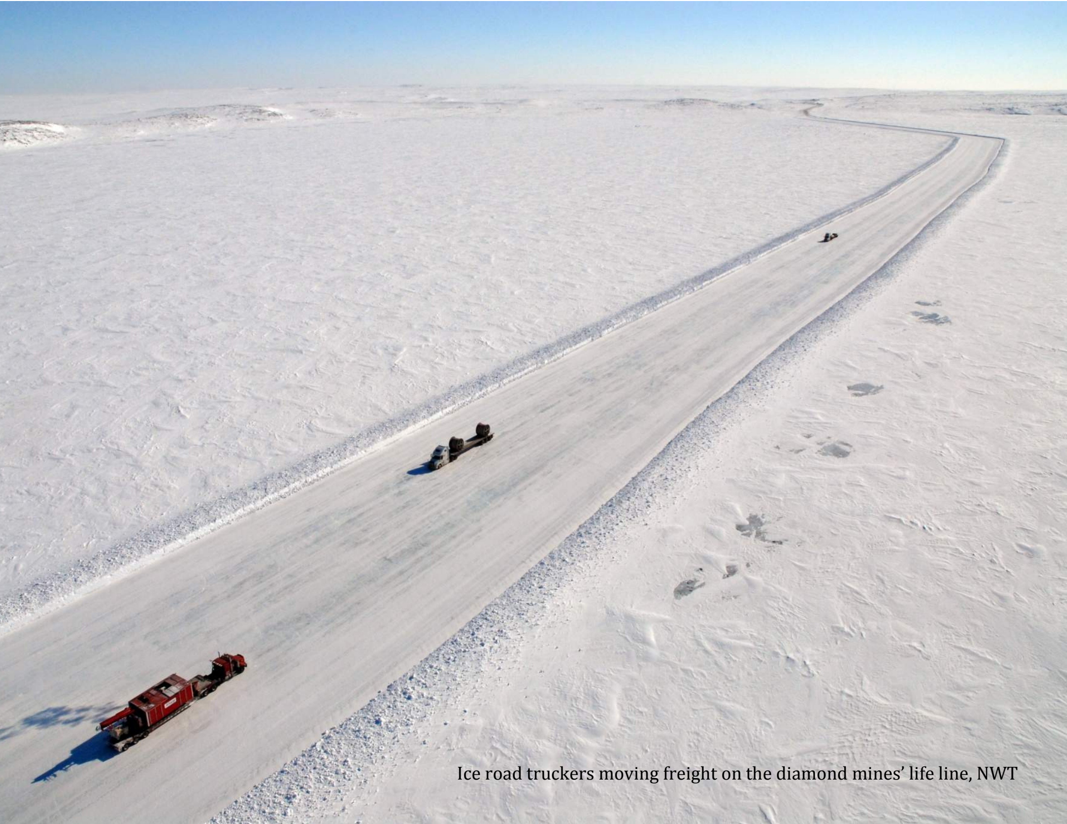
Ice road truckers moving freight on the diamond mines' life line, NWT