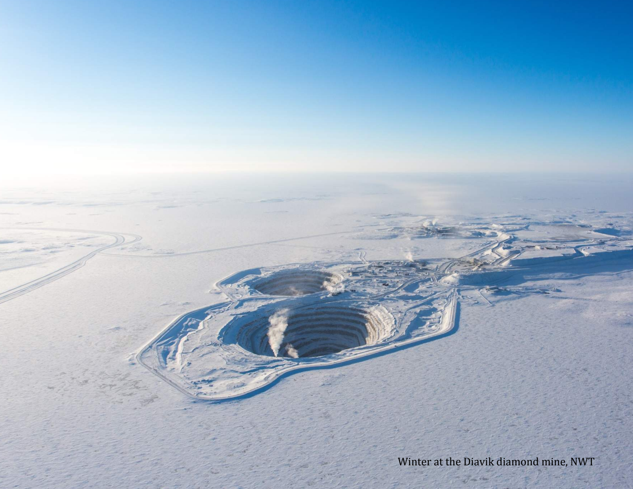
Winter at the Diavik diamond mine, NWT