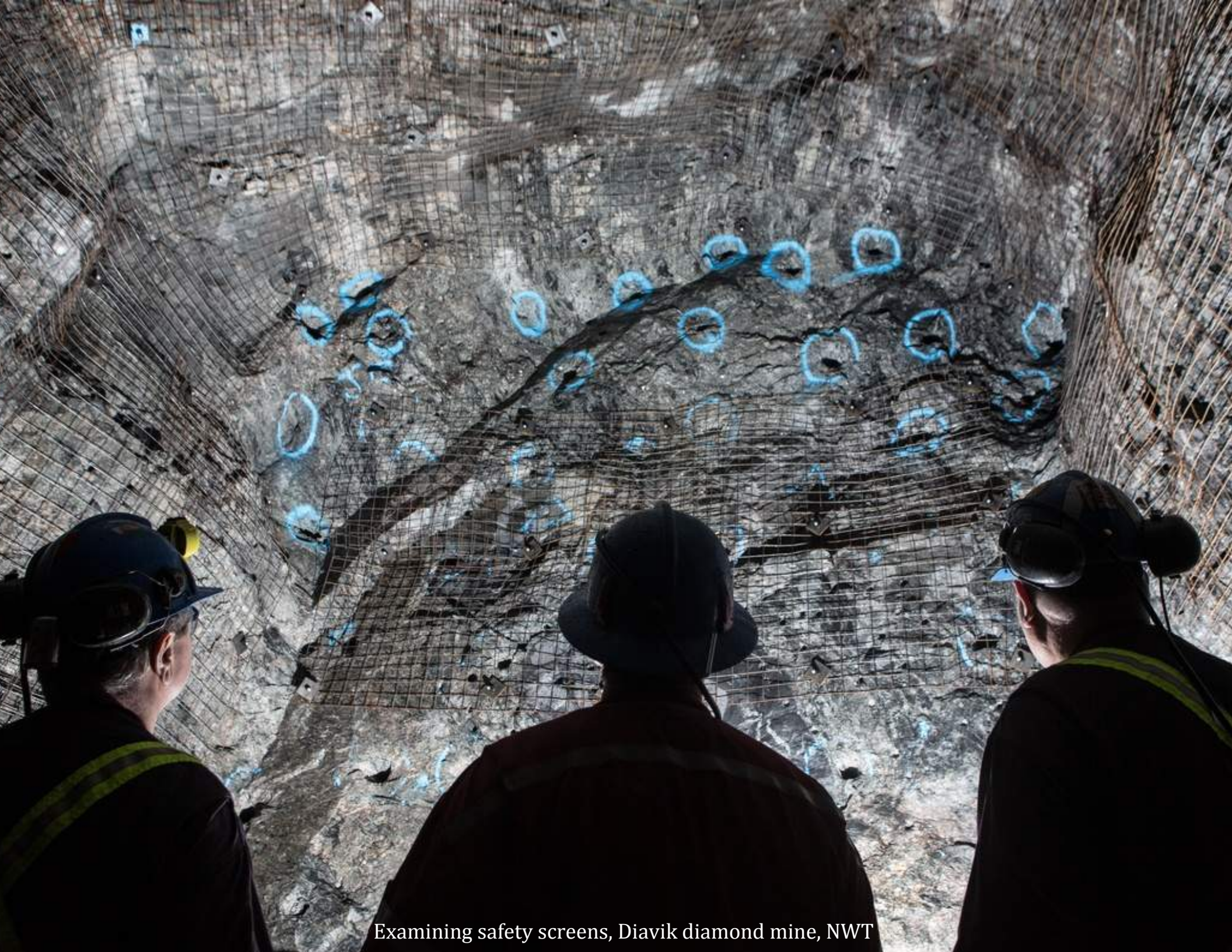
Examining safety screens, Diavik diamond mine, NWT