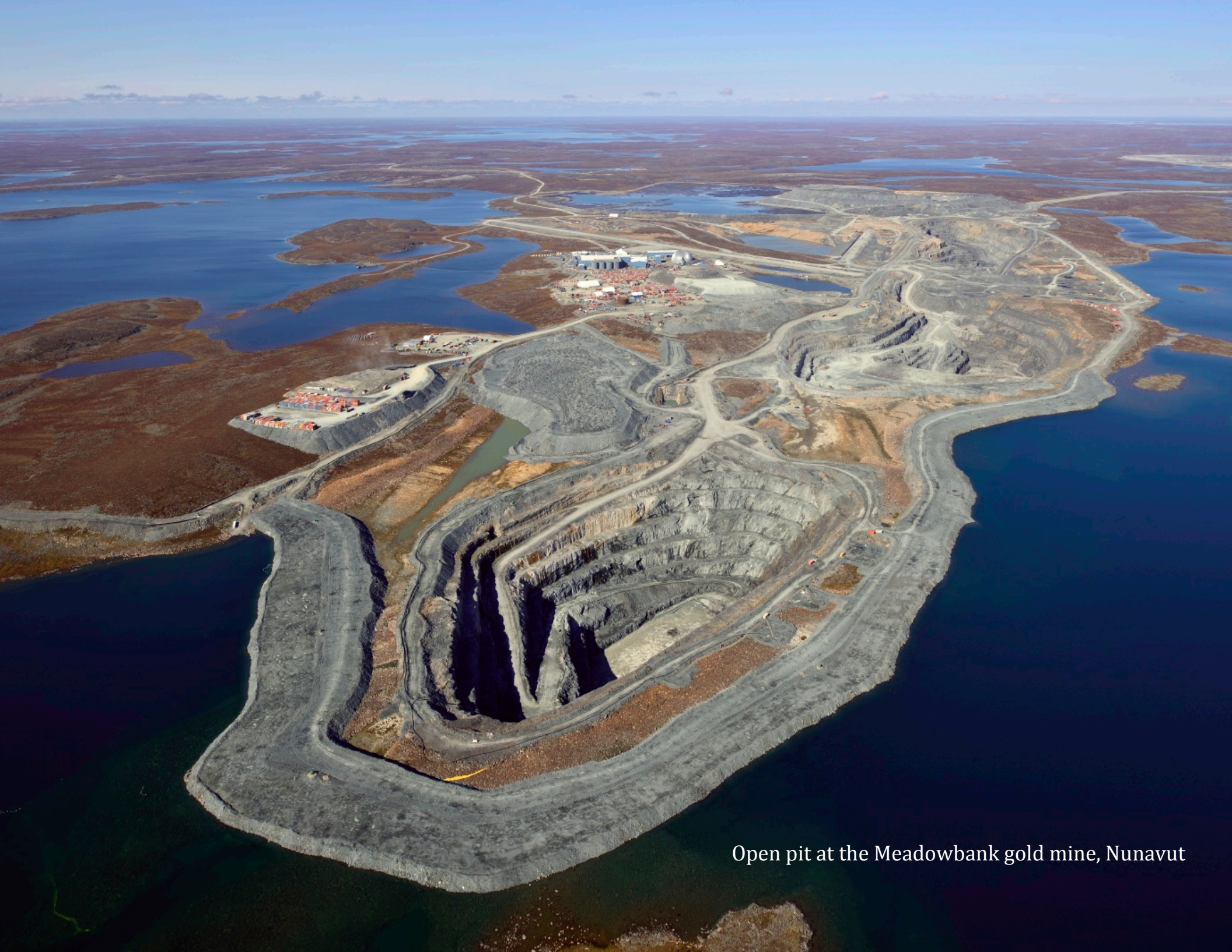
Open pit at the Meadowbank gold mine, Nunavut