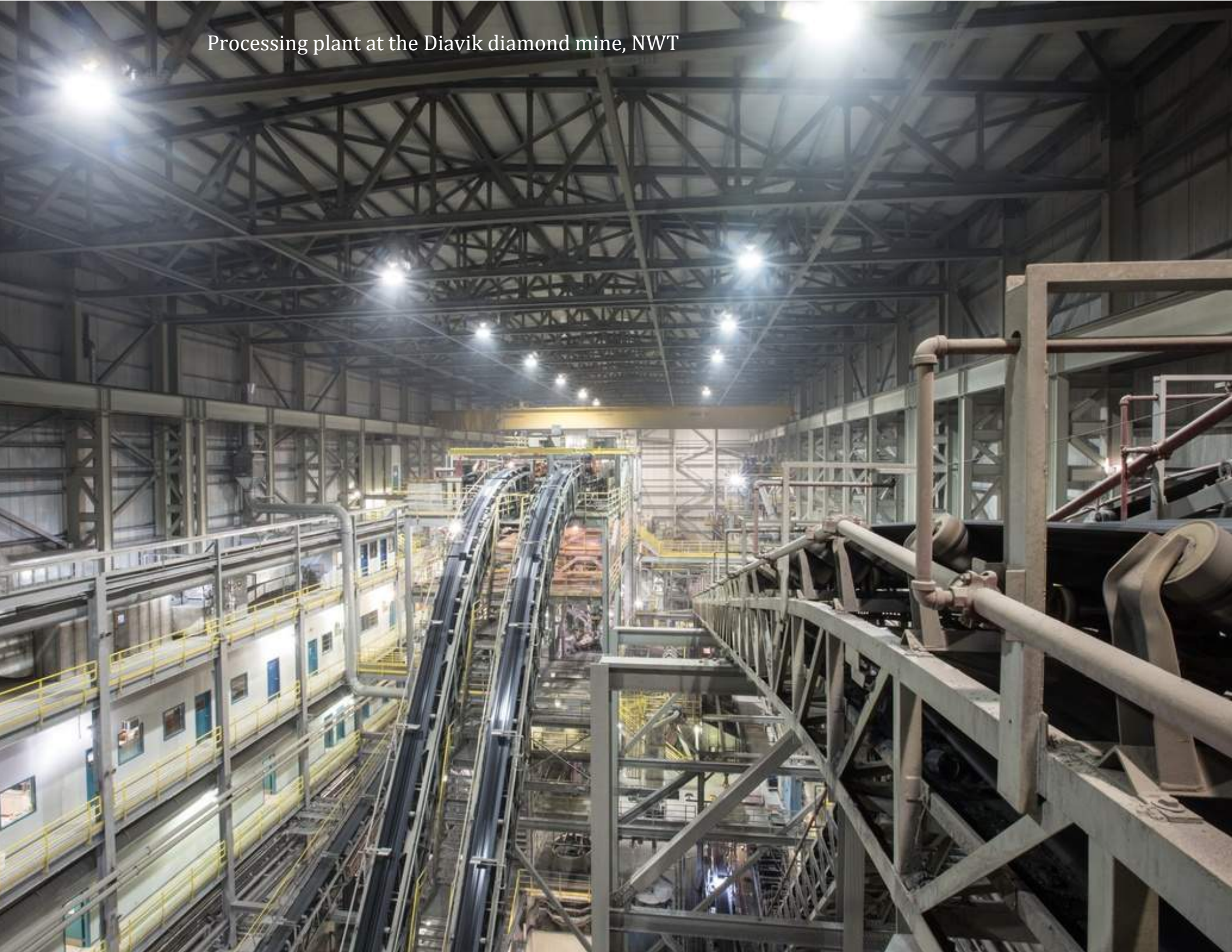
Processing plant at the Diavik diamond mine, NWT