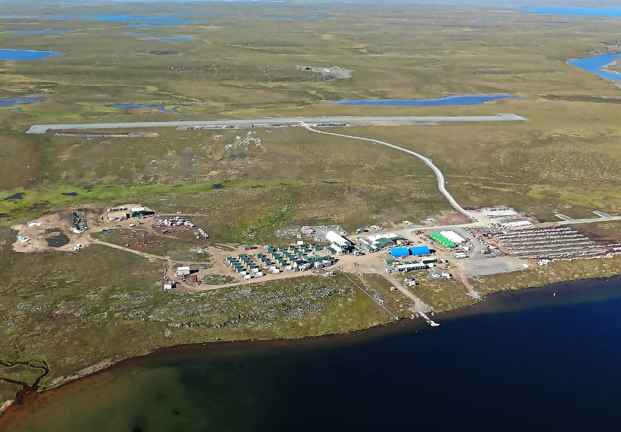
Sabina Gold & Silver Corp., Goose Exploration Camp, Nunavut