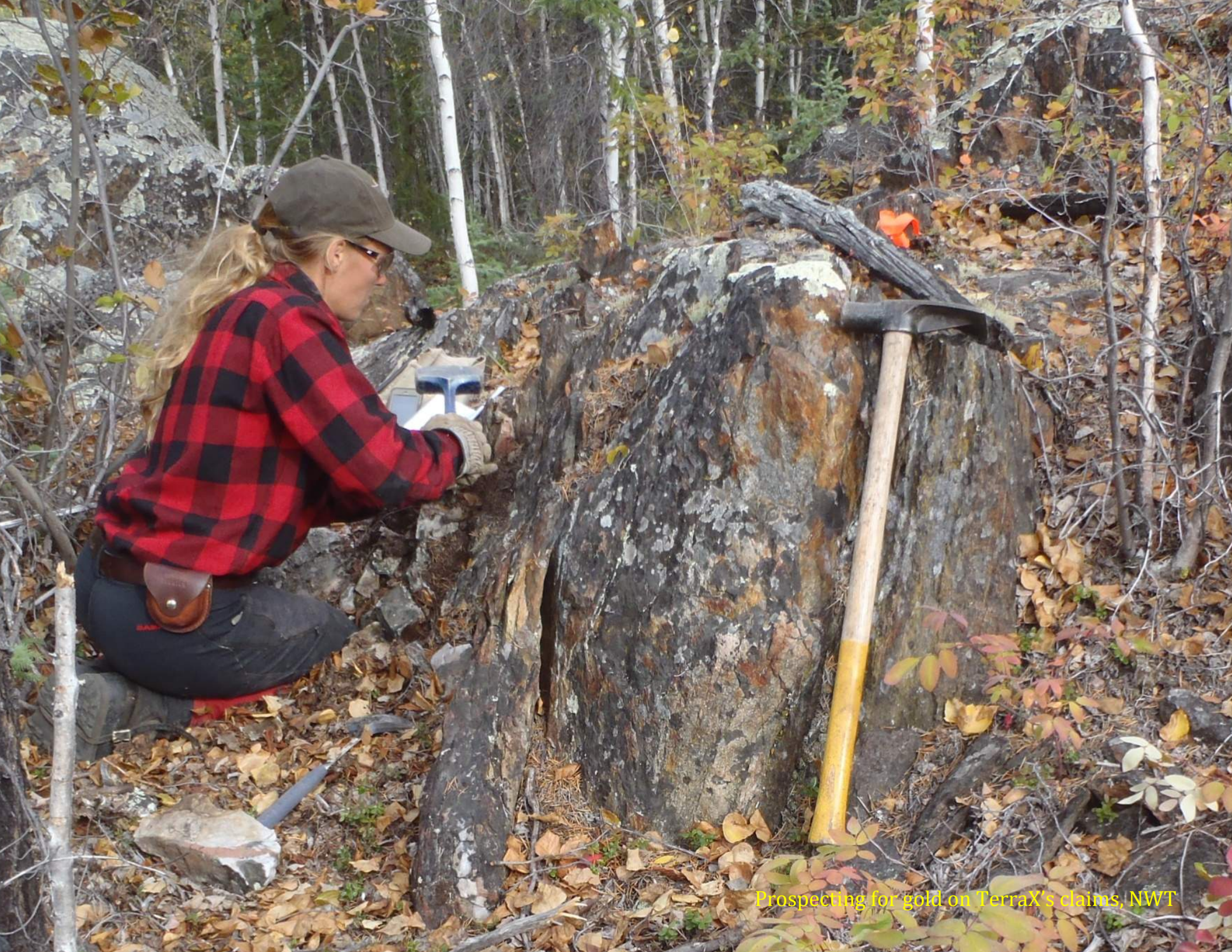
Prospecting for gold on TerraX's claims, NWT