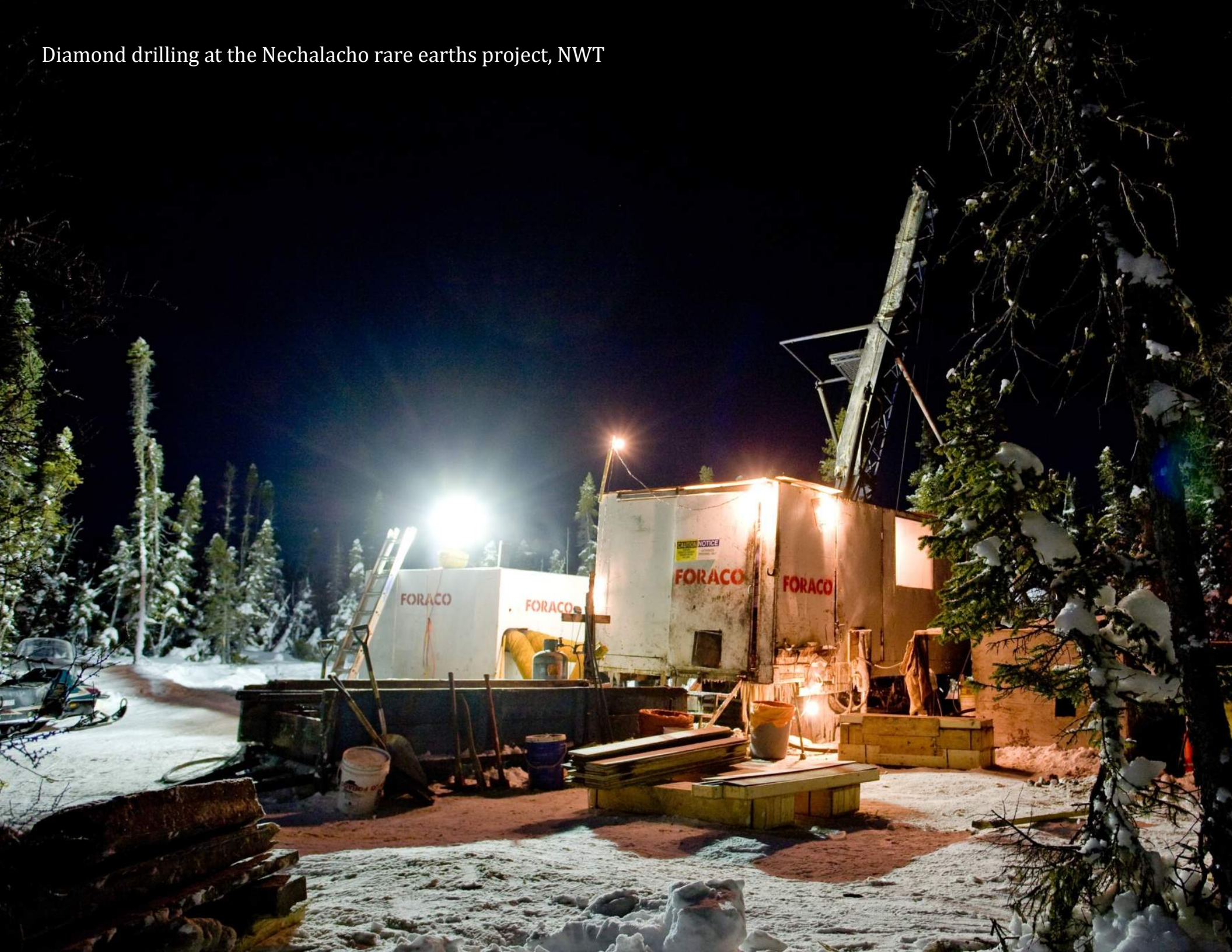
Diamond drilling at the Nechalacho rare earths project, NWT