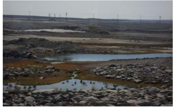
Diavik diamond mine, June 2007

Much has changed since the opening of the Ekati Diamond Mine in October 1998. Although diamond-bearing kimberlite pipes had been discovered, there were no firm confirmations of the magnitude of the riches to be found beneath the permafrost. At the time, the labour market in the Northwest Territories was slow and plenty of skilled trades people were available to start up the industry. The NWT desperately needed development to get its economy out of a protracted slump. The mines were welcomed and not many conditions were put in the way of rapid development.