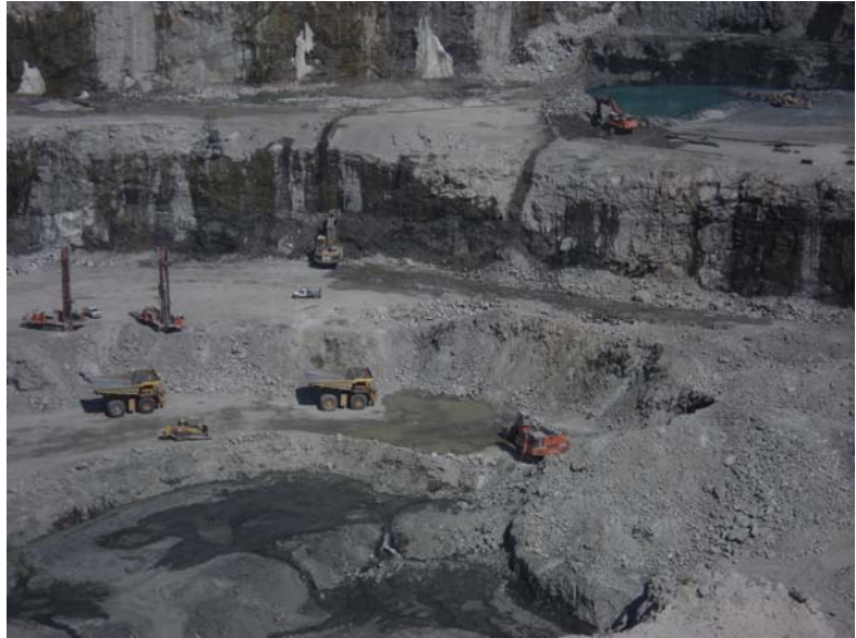
Trucks at work in the Diavik Diamond Mine open pit.

It may be that the process of adapting to new mineral development in a timely fashion is beyond the ability of INAC and the federal government. It is much more likely that a provincial regime — with direct responsibilities for the cost of development, local infrastructure and the provision of services — will act expeditiously to ensure that royalties are commensurate with the needs of the region.