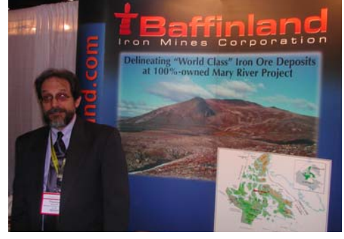
Baffinland Iron's booth in Toronto