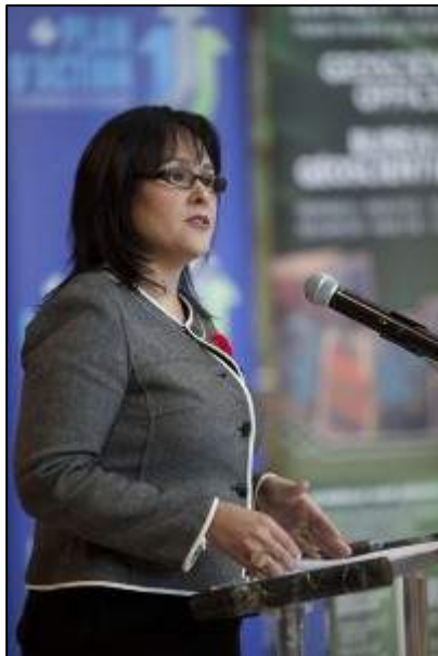
CanNor Minister Leona Aglukkaq

The Canadian Northern Economic Development Agency (CanNor) will invest $3.275 million over three years (2011 to 2014) to support continuing geoscience research and data analysis in the Northwest Territories. “The Government of Canada recognizes that reliable information ... is essential to attract resource development and support the dynamic economic growth we are seeing across the North,” said Minister Aglukkaq. “The data gathered from these projects will provide more certainty for industry and investors, create job and business opportunities for Northerners, and support land use planning.”