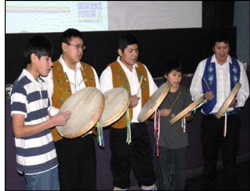
Yellowknives Dene Drummers will open Forum