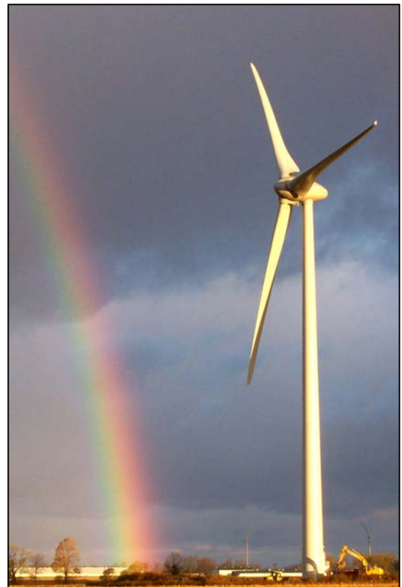
Diavik will construct 4 similar wind turbines

The wind farm is expected to cost about $25 million but save the company $5 million in fuel costs each year.